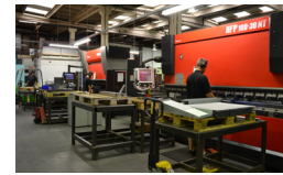
Amada Promecam Autobend 100 Ton HD