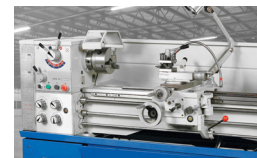
Highspeed Lathe Meyer SB1036