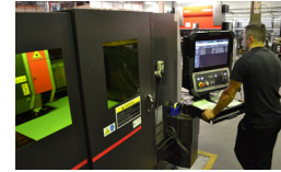
Amada Laser Ensis 3015