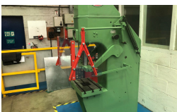
Hare 20 Ton Press