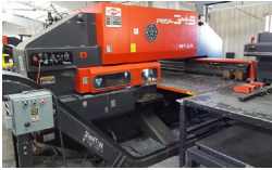
Amada Pega 345