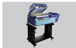
Shrink Wrap Machine