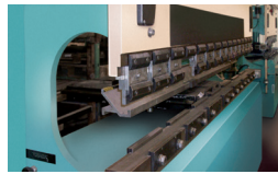
Amada Promecam Autobend 80 TON HFP