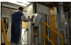
Spray Shop - Gema & TD Finishing