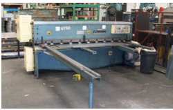
Amada Guillotine GT50