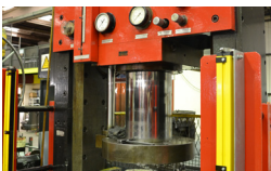
Lagan Press 200 Ton