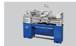
Lathe - Meyer SB1036