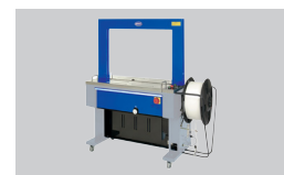
Box Strap Machine - TRS600