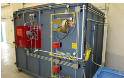
Burn Off Oven