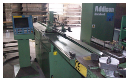
Addison Tube Bender DB 32