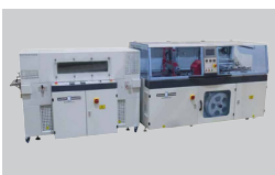
Shrink Wrap Edl & Tunnel 48/ 15 ST 200