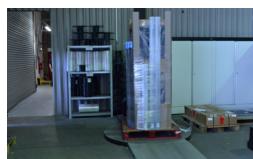
Pallet Wrap Machine EXP-108